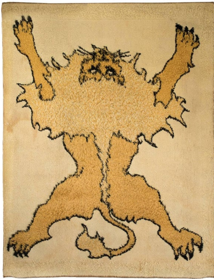
ROBERTO GABETTI & AIMARO ISOLDA TAPILEO RUG, 1970, OFFERED BY SIDE-GALLERY

"Statement rugs like this are not to be hidden under furniture."