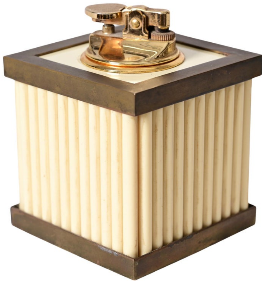
TOMMASO BARBI LUCITE AND BRASS TABLE LIGHTER, 1970, OFFERED BY ITALIAN DESIGN 900 SRLS

"Another gift idea — perfect for lighting dinner candles"