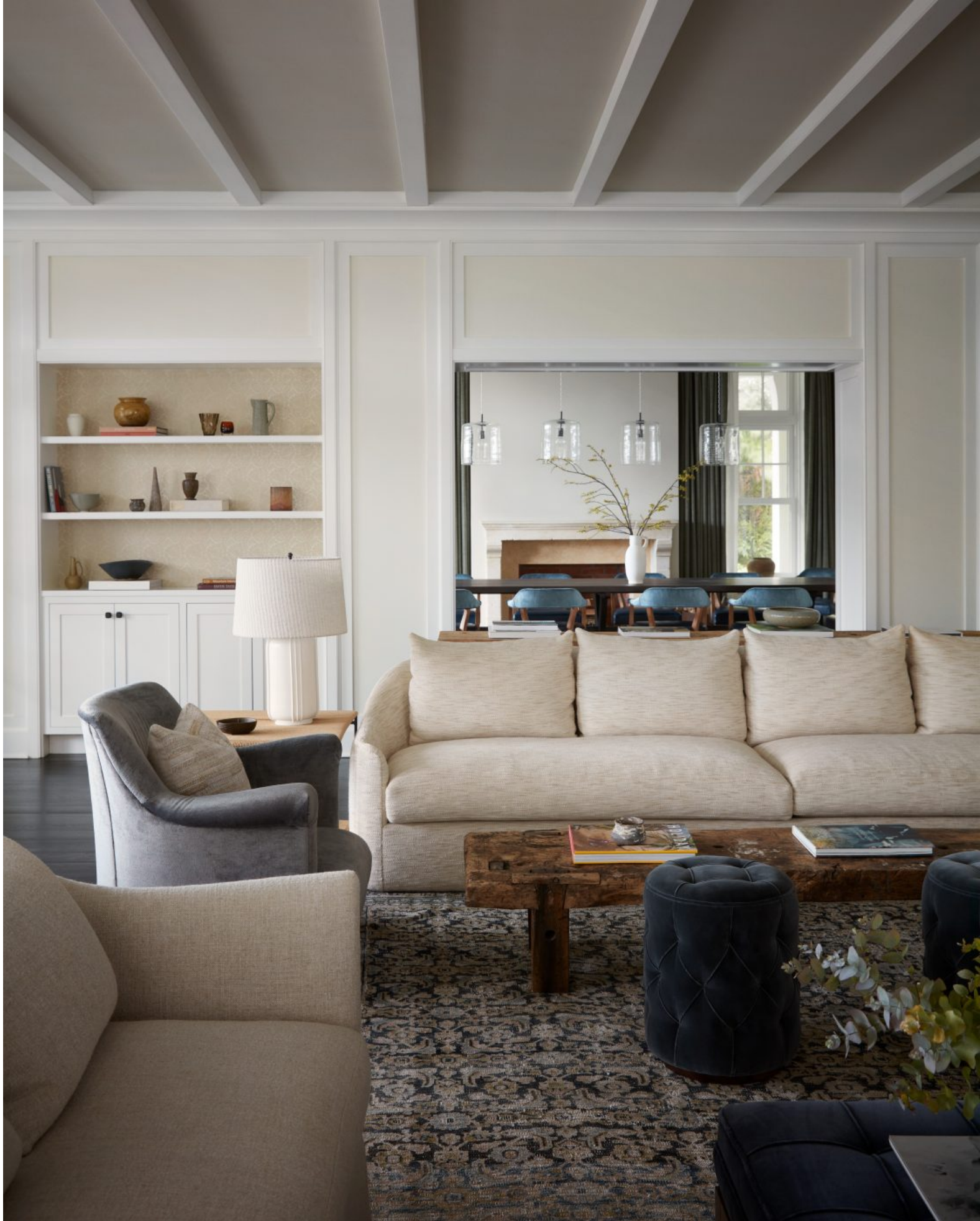
Another view of the living area provides a glimpse of the dining room beyond. The built-in shelves (left) were already in place, says Charles, who added visual interest by papering the niches. Rustic tables from were 1stDibs finds.