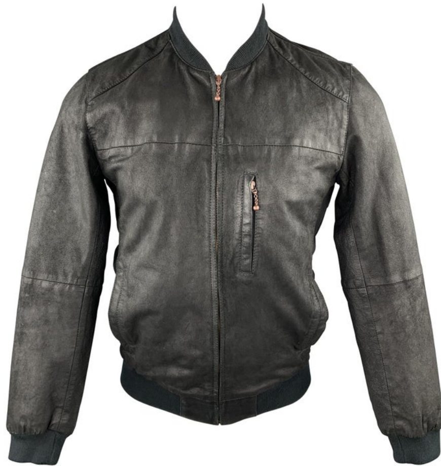
LEVI'S DISTRESSED LEATHER ZIP-UP BOMBER JACKET, CONTEMPORARY, OFFERED BY SUI GENERIS CONSIGNMENT

"Always such an unexpected win to find a great jacket when on an antiques hunt."