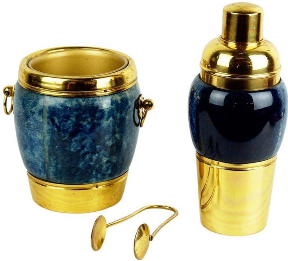
ALDO TURA FOR MACABO BRASS AND BLUE-GOATSKIN COCKTAIL SET, 1960S, OFFERED BY MICHAELA BAUER - VINTAGE INTERIORS

"Vintage barware, all day, everyday. This Italian set would make a great gift. Everyone needs an ice bucket!"