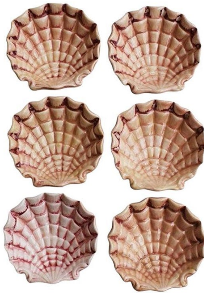
SET OF 6 HOLLYWOOD REGENCY MINI CERAMIC SEA SHELL BOWLS, 20TH CENTURY, OFFERED BY SCOUT STUDIOS

"These are my dream dessert bowls. Shouldn't you always have something with a sense of humor on the table?"